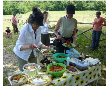
Picnic on Mystical Maremma, May 2008

Fresh green beans (a handful per person for a main meal, half that if served with other salads) A handful of rosemary 1 clove of garlic 100g whole almonds (peeled) Good quality olive oil Lemon juice Salt and Pepper